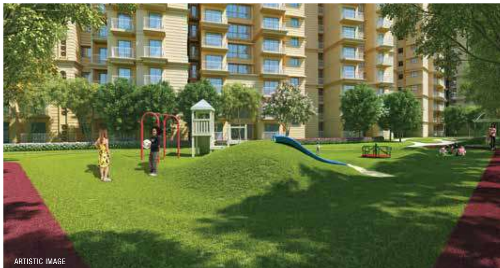
Kid's Play Area