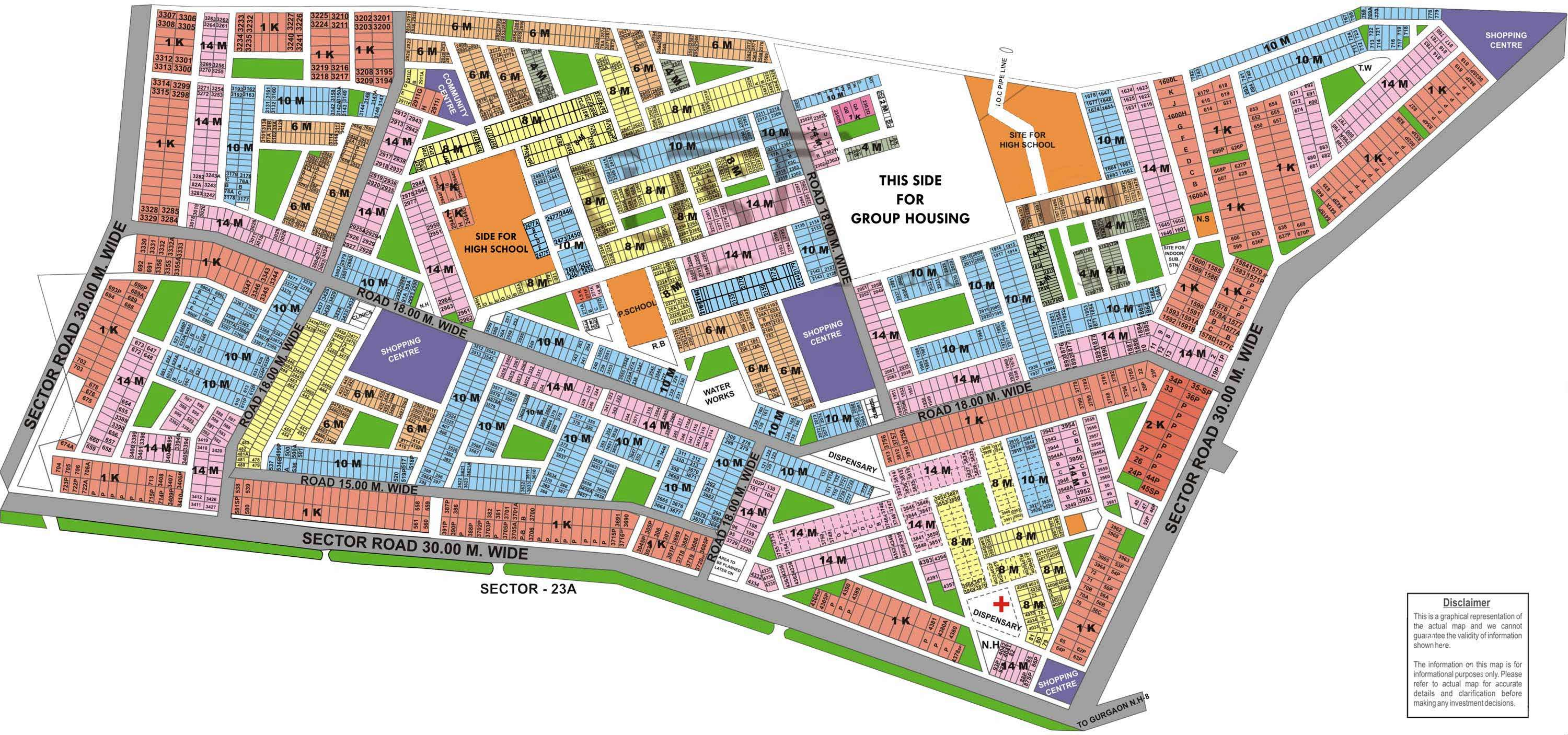
SECTOR - 23A

Disclaimer This is a graphical representation of the actual map and we cannot guarantee the validity of information shown here. The information on this map is for informational purposes only. Please refer to actual map for accurate details and clarification before making any investment decisions.